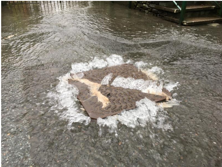
Sewage discharging by Gowan Terrace footbridge and heading for the River Gowan, just 2m away

Partly or untreated sewage spilling regularly into the River Kent, as also shown on page 1